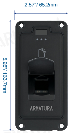
EP30CF (Without metal Case)