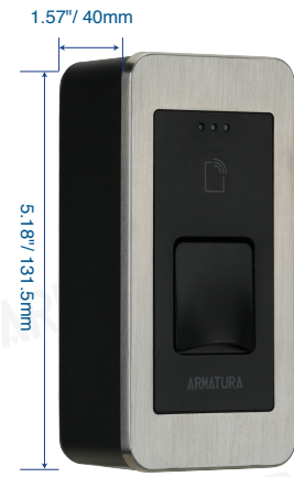
EP30CF (With metal Case & Back Case)