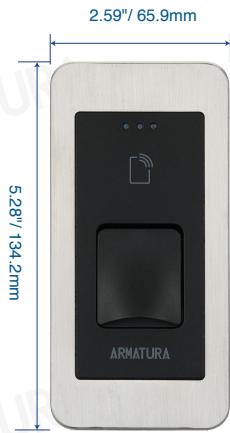
EP30CF (With metal Case)