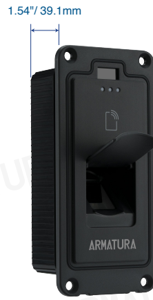
EP30CF (Without metal Case)